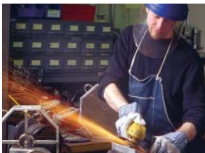
▶MIRATECH Catalyst Manufacturing Better Designed, Better Built.

If you run rich-burn stationary natural gas- or propane-fueled industrial engines, you face tough compliance rules – and stiff non-compliance fines – covering three types of exhaust emissions: carbon monoxide (CO), oxides of nitrogen (NOx), and hydrocarbons (HCs) including volatile organic compounds (VOCs) and a long list of EPA-classified hazardous air pollutants (HAPs).